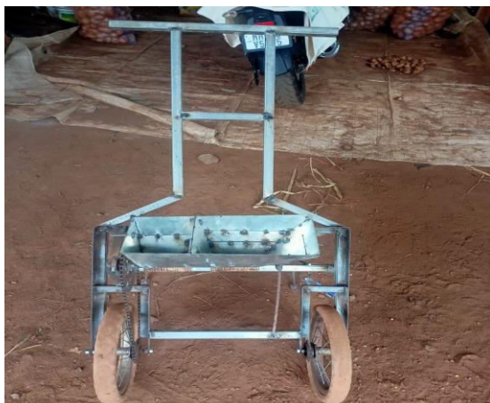
Fig.1. Proposed design for seed sowing machine